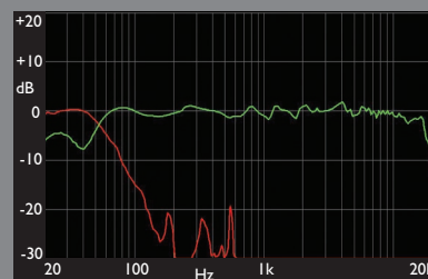
Green - driver output Red - port output